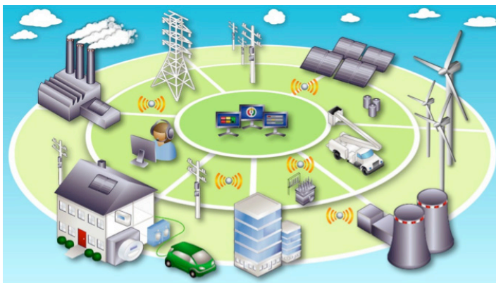
Figure 1. Opportunities for big data analytics are prevalent in the smart grid

Alyssa Farrell Global Energy Solutions SAS