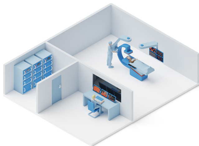
Figure 2: The Prodrive Zeus and Poseidon solutions help process data-intensive X-rays and output the footage to multiple displays in the surgical theater and an adjacent control room.

Prodrive Technologies offers both the Zeus server and Poseidon IPC with a long life cycle of 10 years, backed by long-life availability for 4th Gen Intel Xeon Scalable processor and 12th Gen Intel Core processor IoT SKUs. 2 Within a 10-year life cycle, the first two to three years are simply for getting the platform certified. For example, in the United States, healthcare devices need to be approved by the Food and Drug Administration (FDA). Once approved, device configurations cannot be significantly changed without triggering another certification cycle, which means that hospitals need a consistent supply of parts, support, and services for their existing solutions. By providing an extended life cycle of 10 years (and longer in select cases), Prodrive Technologies and Intel are helping hospitals maximize the value from each certification cycle.