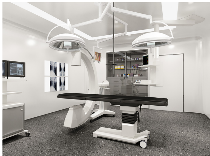
Figure 1: Minimally invasive surgeries often rely on interventional X-ray to help surgeons navigate the surgical site.