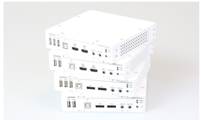
Figure 4: AVIDIS converts video input/output to 10GbE data, allowing hospitals to easily add more equipment and displays with a simple network connection.

A key advantage to the Prodrive Technologies solution is that everything is connected over Ethernet using familiar switch technology. Customers and solution providers can scale the